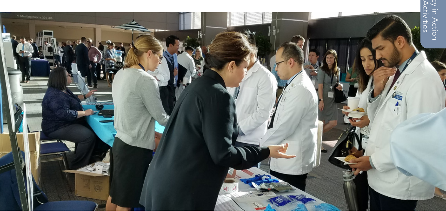
ACS California Lobby Day 2019

ACS partnerships with state specialty societies and other like-minded health organizations help establish strong allies on surgical issues.