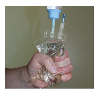
Flip the container upside down and squeeze the bag