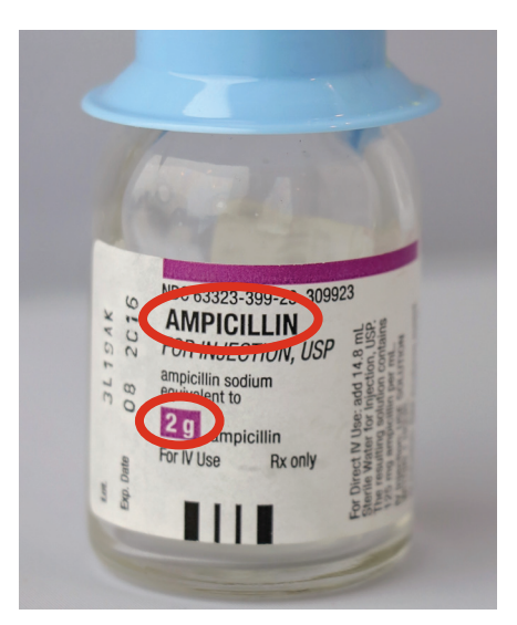
Check the label