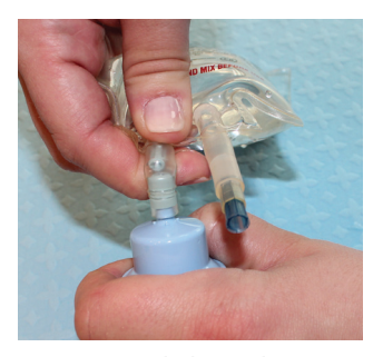
Break the seal