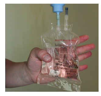
Release the bag