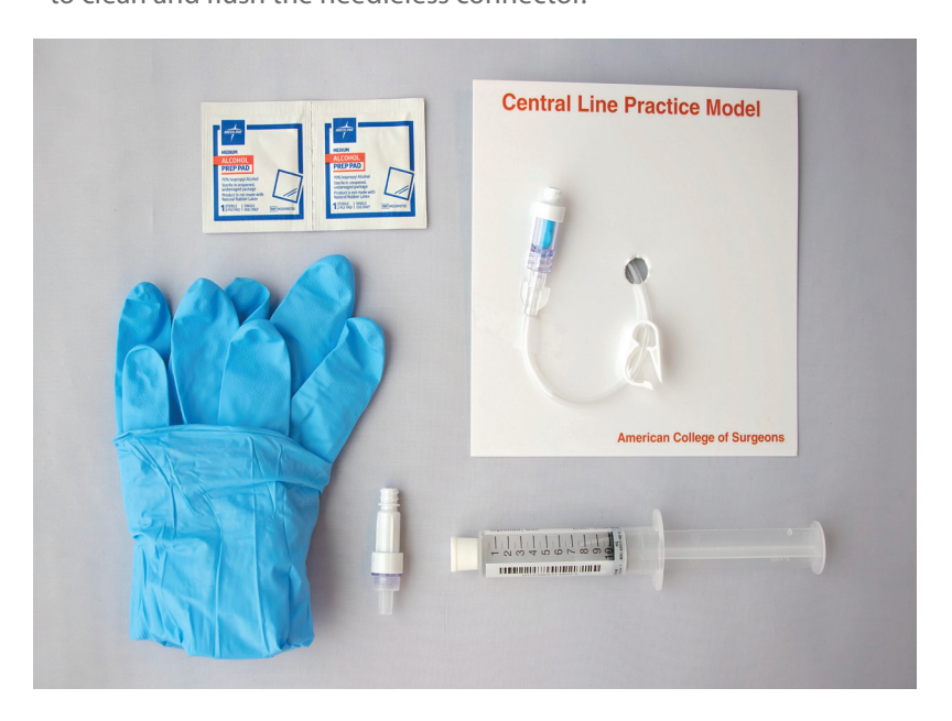
American College of Surgeons • Division of Education