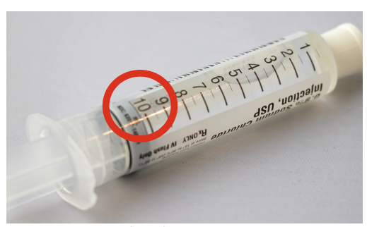
10 mL syringe

Only use 10 mL syringes when flushing or giving medications. This will prevent excess pressure on the CVAD.