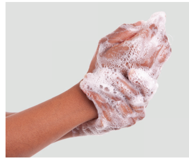
Wash your hands the right way