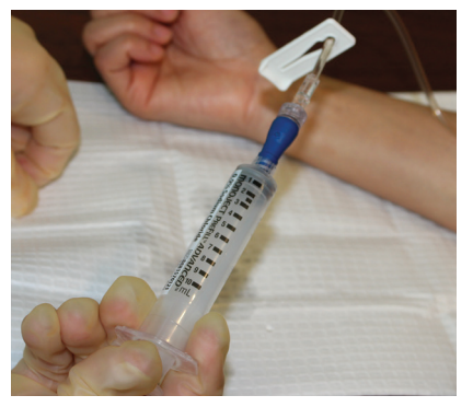
Unclamp the line and flush