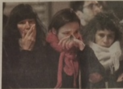
People reacted on Saturday morning, near the scene of one of Friday's terrorist shootings in Paris.