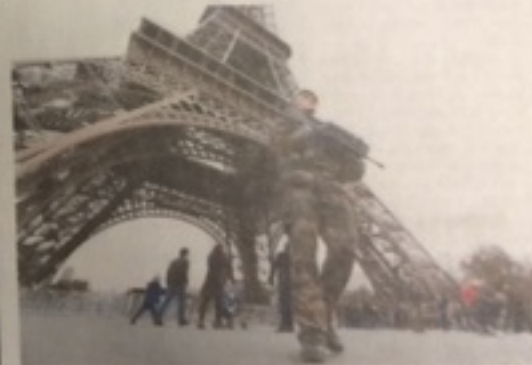
Members of the French military patrolled near the Eiffel Tower, one of several popular tourist sites closed Saturday.