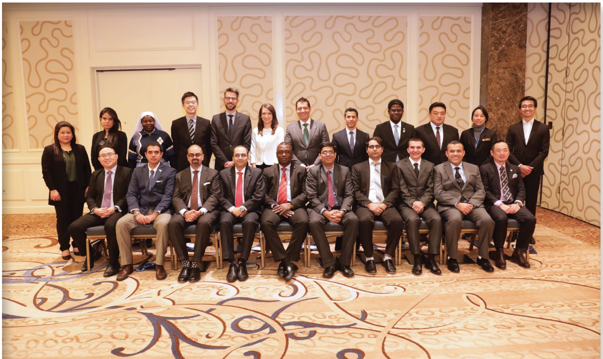
International Guest Scholarship recipients at Clinical Congress 2019