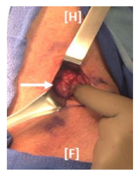
Figure 2. Operative exploration was performed via a Kocher incision. On retraction of the sternothyroid muscle, a lesion (white arrow) was noted lateral to the inferior pole of the left thyroid lobe.

Operative exploration was performed via a transverse cervical Kocher incision. On mobilization of the left thyroid lobe, an approximately 3 cm lesion was identified inferiolateral to the left thyroid (figure 2), corresponding to the lesion identified on ultrasound and sestamibi scan.