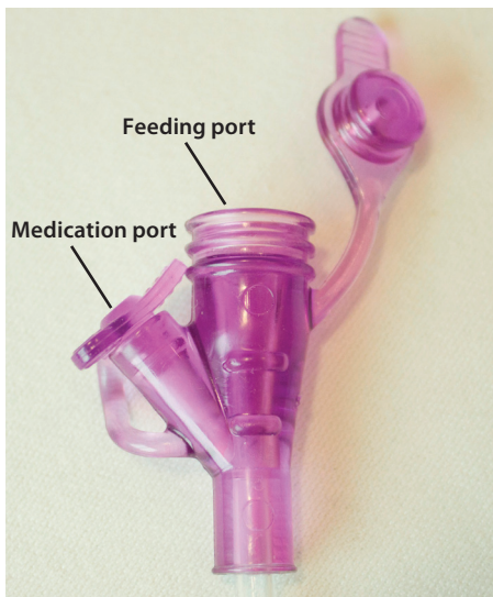
Feeding and medication ports