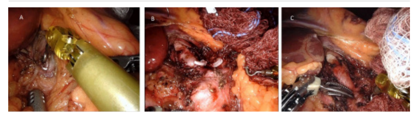
Figure 2. Robotically Assisted Laparoscopic Release of Median Arcuate Ligament. Published with Permission

A) Beginning of procedure before release; B) complete dissection and release of celiac artery; and C) exposed celiac artery take off