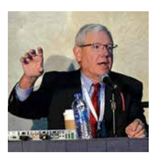
Ten Hot Topics in General Surgery Wednesday, October 25 | 12:45-2:15 pm

This pro/con debate will cover two common topics faced by general surgeons. The first will debate percutaneous cholecystostomy versus cholecystectomy for acute cholecystitis, and the second will cover open versus minimally invasive surgery (MIS) repair for inguinal hernia.