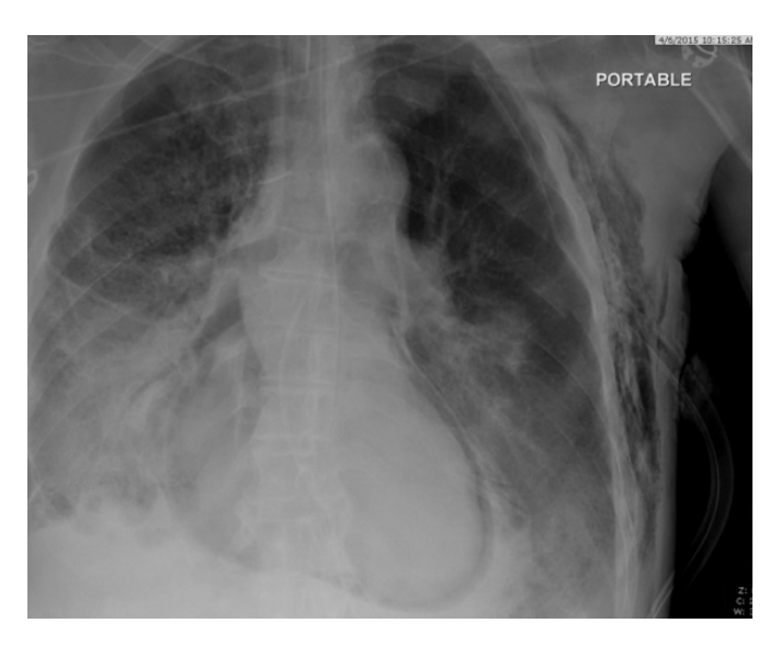
Figure 3. Chest X ray after placement of percutaneous drain.