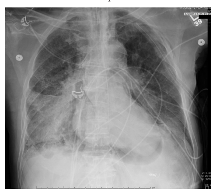
Figure 1. Admission Chest X ray demonstrating placement of left thoracostomy tube and pneumomediastinum.

The patient, a 73-year-old male with a past medical history of HIV and COPD, presented after a motor vehicle crash in which he was the restrained driver without loss of consciousness. He sustained multiple left-sided rib fractures, hemopneumothorax, pneumomediastinum, and splenic laceration requiring angiographic embolization. A chest tube was placed to drain the left-sided hemopneumothorax (Figure 1). Although the patient initially presented hypertensive, he experienced intermittent bouts of hypotension, which were responsive to volume resuscitation. The patient was admitted to the surgical intensive care unit in respiratory failure requiring intubation with high FiO2. Crystalloid resuscitation was continued due to elevated stroke volume variation. A cortisol stimulation test was performed and was negative. A transthoracic echocardiogram was performed at the patient's bedside, and did not demonstrate evidence of pericardial fluid.