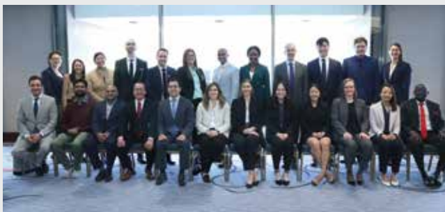
ACS scholars were celebrated during the Philanthropy & Scholarship Luncheon at Clinical Congress 2024 in San Francisco.

“It is so important to give to the ACS Foundation because it’s the one place where you know your money is going to do so much good for so many. You’re really investing in the next generation. And those are the same people who will take care of you someday.”