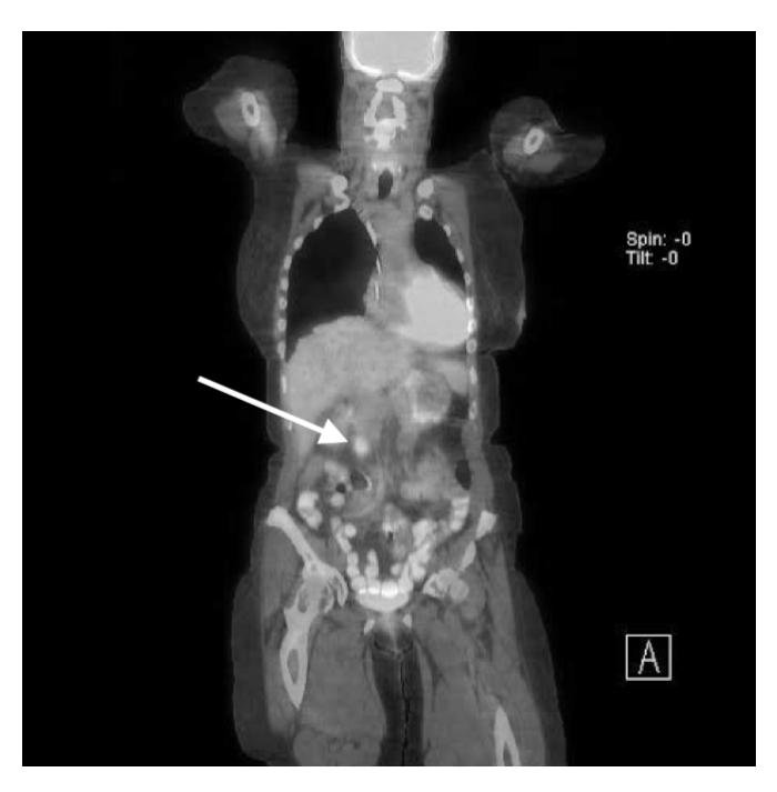
Figure 1. PET-CT imaging with 18F-FDG displaying a hypermetabolic focus. This suggests an enlarged lymph node adjacent to the superior mesenteric vein and inferior to the splenoportal confluence abutting the pancreatic head. The focus demonstrates a maximum SUV of 4.12. The 8 mm right inferior hepatic lesion seen on a previous CT scan is below the resolution of the PET-CT.

Neither a follow-up MRI nor positron emission tomography (PET)-CT scan with <sup>18</sup>F-FDG in April 2014 detected the hepatic lesion. No liver biopsy was performed. However, the MRI and PET-CT did identify a hypermetabolic focus of 4.12 SUV concerning for an enlarged peripancreatic lymph node near the superior mesenteric vein (Figure 1).