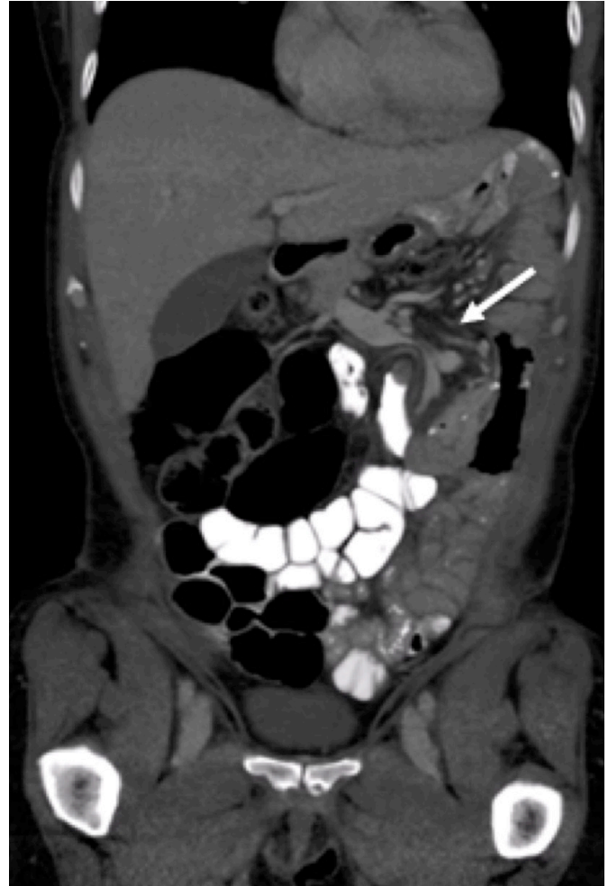
Figure 1. Coronal section of a CT scan of the abdomen showing mesenteric vein compression (white arrow)

On presentation, the patient's vital signs were within normal limits (temperature: 36.8°C; blood pressure; 121/76 mm Hg; heart rate: 76 bpm; respiratory rate: 16). On physical exam, the patient's abdomen was soft, nontender, and nondistended, with well-healed surgical scars. Relevant laboratory studies were all unremarkable. The patient had an abdominal CT scan that showed contrast permeating to the colon and no signs of mesenteric swirls. The scan was initially read as normal. Upon further review of the CT scan, the superior mesenteric vein was compressed and was in a different position than on previous scans (Figure 1). The differential diagnosis based on CT findings, surgical history, and history of present illness included internal hernia, obstruction due to adhesion or mass, or stricture. For any of these etiologies, diagnostic laparoscopy is the appropriate course for diagnosis and treatment.