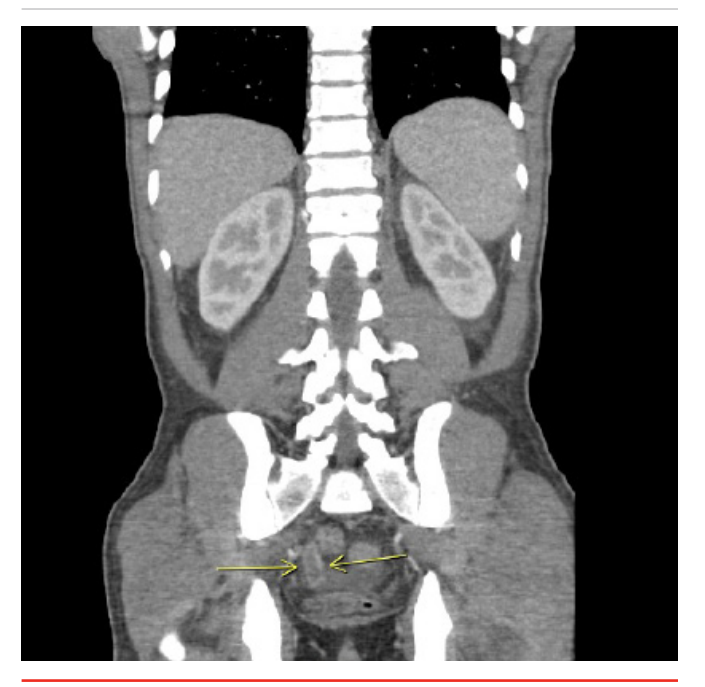
Figure 1. CT Scan: Tip Appendicitis in Pelvis. Published with Permission

On physical examination, his vitals were within normal limits. He was very thin and had diffuse palpable lymphadenopathy in the cervical and inguinal regions and a large mobile left cheek mass. His abdominal exam was benign, with no anterior abdominal pain but rather bilateral flank pain. The patient's leukocytosis was 13,000 k/cm<sup>2</sup> with the remainder of his labs within normal limits; the cluster of differentiation 4 (CD4) count was 2670, and the viral load was 1,391,823. HTLV-I/HTLV-II antibodies were positive. A CT of the abdomen and pelvis with oral and intravenous (IV) contrast was obtained, showing acute tip appendicitis (Figure 1) and extensive bulky gastrohepatic, periportal, peripancreatic, retroperitoneal/para-aortic, bilateral iliac chain, and bilateral inguinal lymphadenopathy (LAD) (Figure 2) with mild splenomegaly suggestive of lymphoma. A CT maxillofacial scan to evaluate his cheek mass also demonstrated extensive bulky cervical lymphadenopathy as well as an enlarged mandibular mass (Figure 3). Of note, the patient had a CT scan performed one year prior that showed an appendix with the same diameter but no local inflammation (Figure 4).