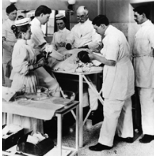
Dr. McBurney operating at Roosevelt Hospital, 1901.

Dr. McBurney was a true general surgeon. In addition to his contributions to appendectomy, one of his most noted achievements was his description of a technique for repairing fracture dislocations of the shoulder (often a complication of attempts to reduce a dislocation). 6 In 1898 he described sphincterotomy for impacted gallstones, 7 and in 1901, Dr. McBurney was called to Buffalo, NY, to evaluate the postoperative condition of President William McKinley and was subsequently unfairly criticized for stating an overly optimistic prognosis.