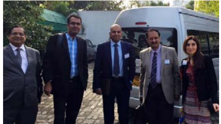
In Sri Lanka

Overall, this was a fabulous trip. I have a strategic plan moving forward to provide instruments for box trainers, set up sites for observership in the U.S., and work on faculty internet based conferencing. I feel that there is something sustainable that can be developed. It feels good to know that maybe in some small way, I can give back to the country of my birth.