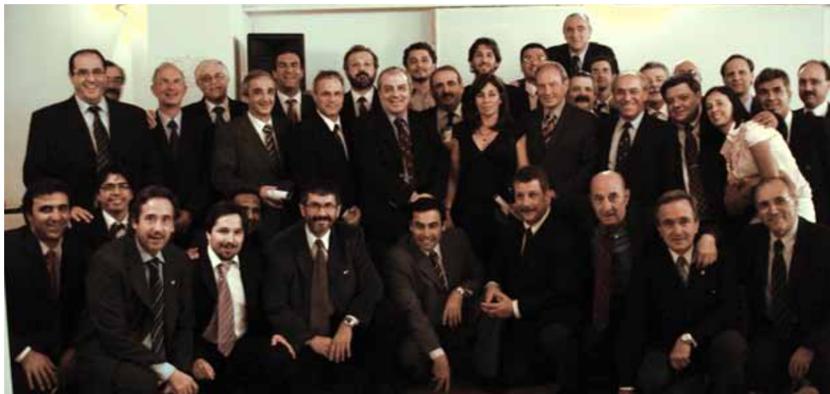
Latin American ATLS Family