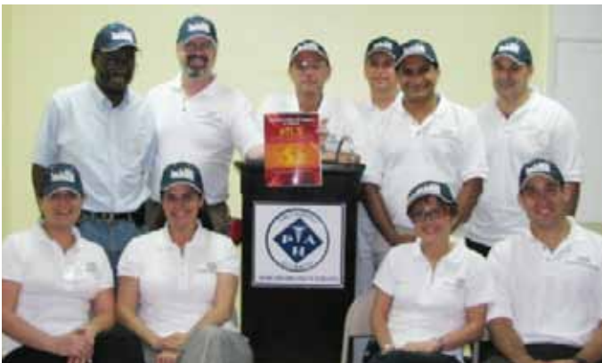
ATLS Faculty and Coordinators