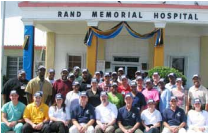
Course Participants and Faculty