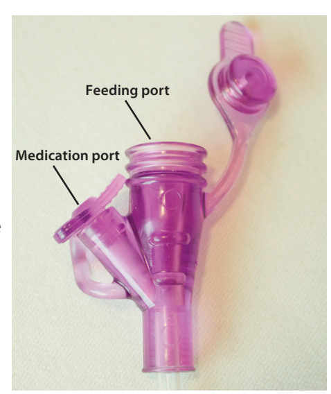
Feeding and medication ports