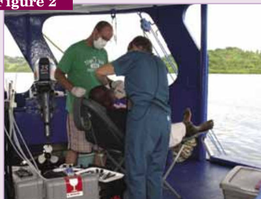
The stern of the boat was used for dental procedures and some minor surgical procedures.