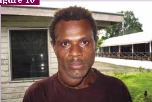
A lymphadenovarius involving the cheek.