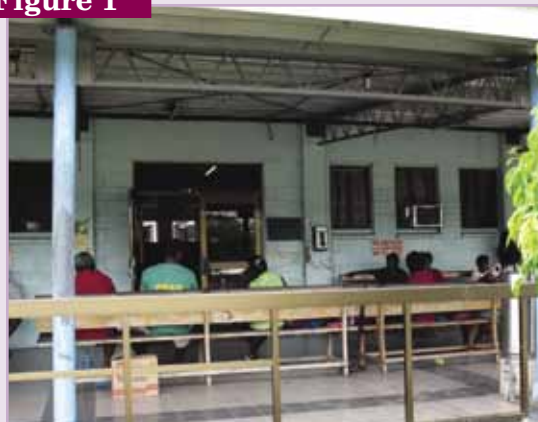
The entrance to Casualty and Emergency Room at the NRH.