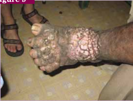
A case of filariasis.