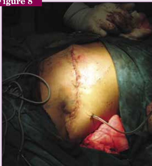
Diseases present in advanced stages due to lack of health care access. A large necrotic and fungating breast cancer, and the post-op mastectomy result.