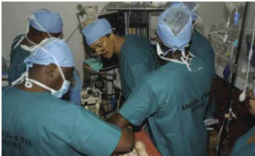
Anesthesiologists training in the Simulation Center.

Once there was agreement that this was a worthy project and that the financial and political hurdles could be overcome, it was critical to have the surgical leadership at the Korle Bu Teaching Hospital travel to Hartford Hospital to take the ATOM Course, in order to understand the details involved in implementing the course in Ghana. A number of surgeons from the West African College of Surgeons came to Hartford Hospital and successfully completed the course. The principal investigator of the Simulation