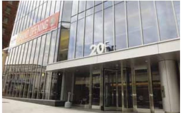
The facade of 20 F Street, NW, with the grand opening banner.