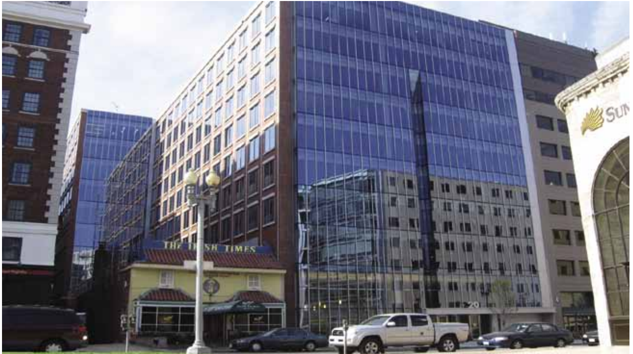
The completed DC headquarters building at 20 F Street, NW.

ies to address issues of mutual concern, such as outcomes measurement, Medicare payment, liability, workforce shortages, patient safety, and so on. The remaining nine floors house the staff members of several other organizations, including the National Business Group on Health.