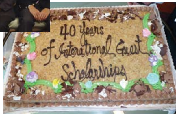
Right: The IGS program birthday cake.