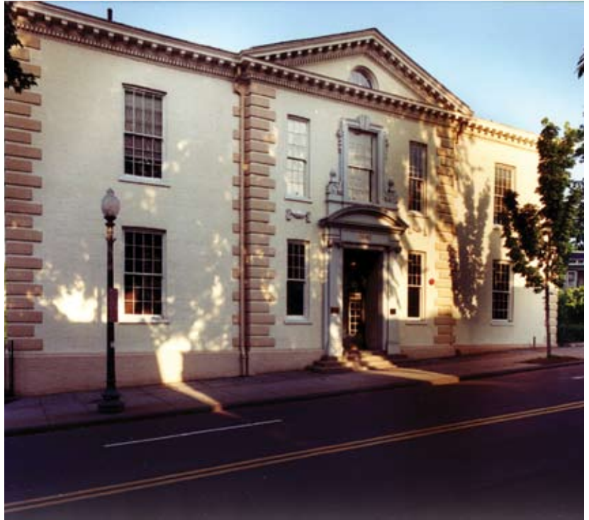
The current Washington Office.

It is becoming more important that all of surgery come together and speak with one voice about the issues that affect the profession. To ensure that all of surgery is speaking in unison, the College has been reaching out to the specialty societies and forming partnerships with groups that have interests and concerns in common with the College. For example, we have formed the Surgical Quality Alliance to address outcomes-related topics. The ACS also participates in and develops strategies for coalitions that are seeking to achieve passage of legislation regarding Medicare payment, liability, and health system reforms, as well as funding for trauma and National Institutes of Health programs.