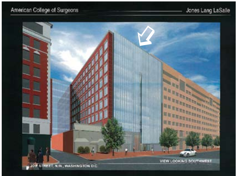
An artist's rendering of the new structure.