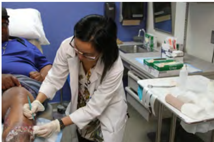
Debriding the ulcer