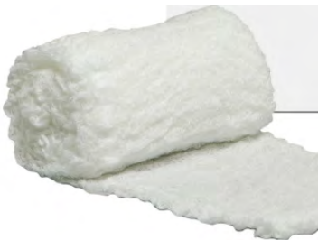
Loosely woven gauze