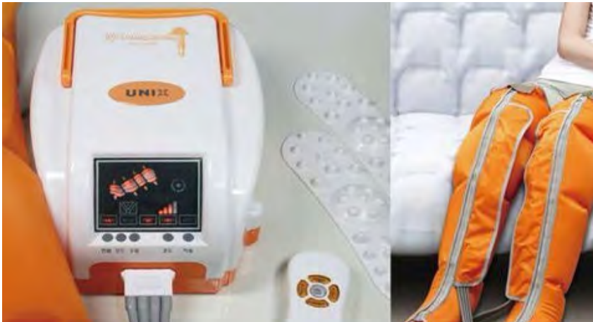
Intermittent pneumatic compression