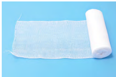
Tightly woven gauze