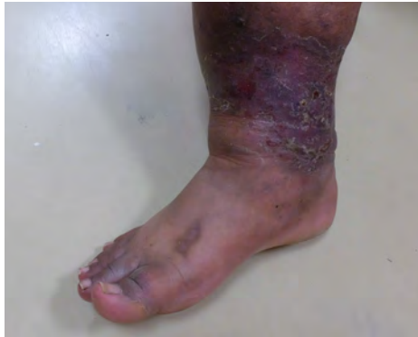
Venous ulcer and lymphedema

Ask if your radiation treatment will be aimed at lymph nodes, so you'll be aware of the possible risks.