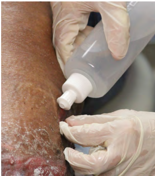
Moisten your wound with saline to remove all pieces of an old dressing