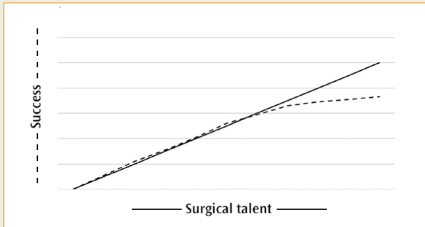
FIGURE 1. EMOTIONAL INTELLIGENCE, TEAMBUILDING

Adapted from: Gladwell M. Outliers: The Story of Success